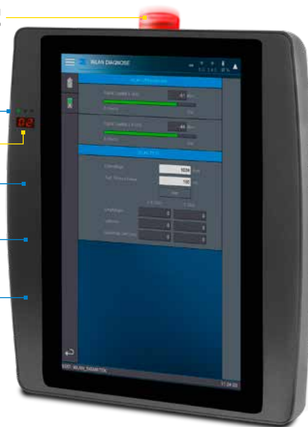
HGW 1033-3 Front View