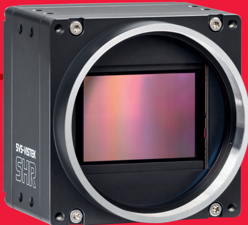
Image Processing by Fabrimex Systems Cameras - Lighting - Lenses