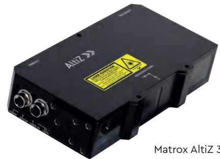
Matrox Altiz 3D

The highly precise Altiz high-speed 3D profile sensors feature a single-laser design with two cameras, significantly reducing scan gaps. Specialized algorithms inside the sensor automatically generate reliable 3D data in the form of individual profiles, depth maps or point clouds. A standard GigE Vision interface allows the user to directly work with a variety of image processing software.