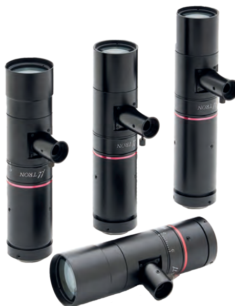
MYUTRON – Telecentric Lens