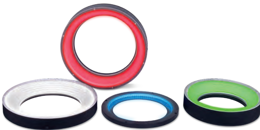
OPT Machine Vision – Ring Lights