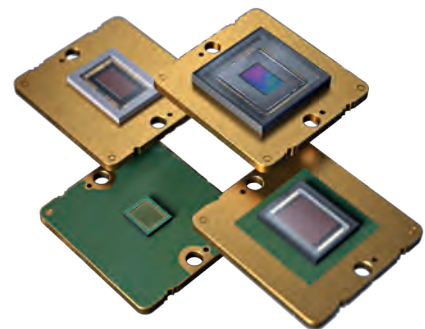
MIPI Camera Modules

Ultra-compact MIPI camera modules are ideal for embedded systems. They are fully compatible with all common processor boards. Corresponding drivers are available in source code. Our MIPI CSI cameras are compact, cost-optimized and available long-term.