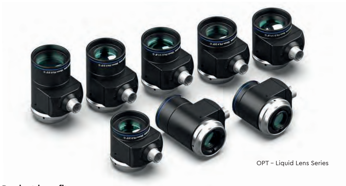
OPT – Liquid Lens Series

From quality assurance to production automation, lenses are an integral and critical quality factor in every image processing application. Immerse yourself in the world of industrial image processing and discover how our lenses can exceed your requirements for image quality and accuracy. We collaborate with large and reliable manufacturers such as OPT, Schneider-Kreuznach, Myutron and many others.