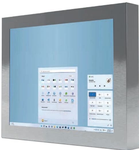
4:3 Ratio 12" to 19"

But that's not all – we go beyond the ordinary. For outdoor use and public display projects, we offer heavy-duty vandalism-safe products that ensure unparalleled durability and security.