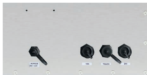
Waterproof M12 with Special Cables