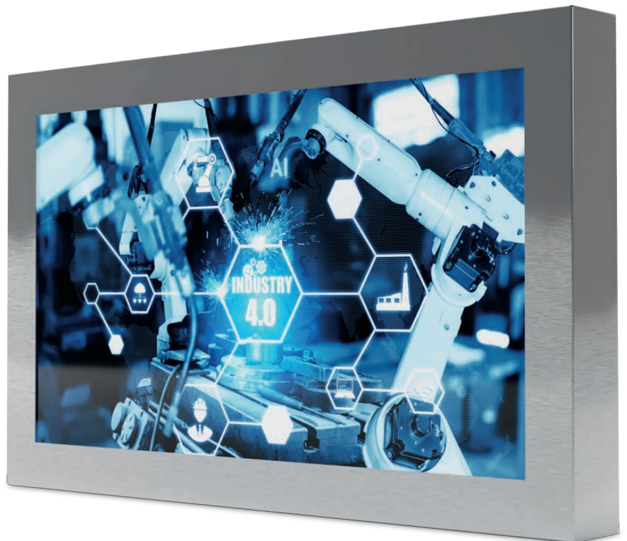
16:9 Ratio 15.6" to 75"