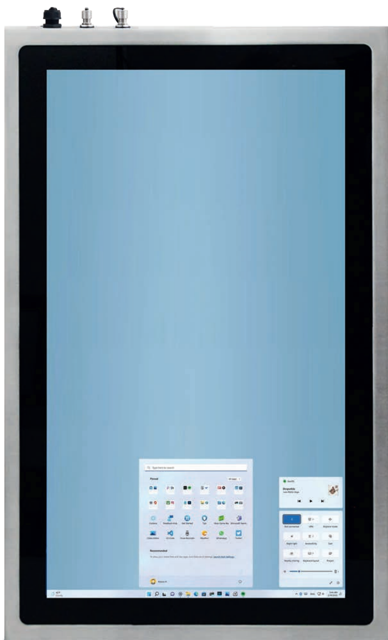
Customization with Low MOQ